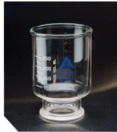
47mm 300ml Funnel