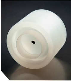
Universal Cartridge Adapter