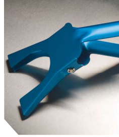
90mm Aluminum Clam