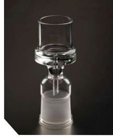
Glass Cartridge Adapter