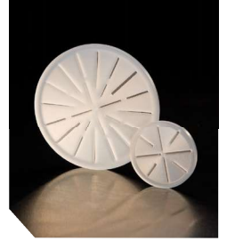
47mm/90mm KEL-F Screen