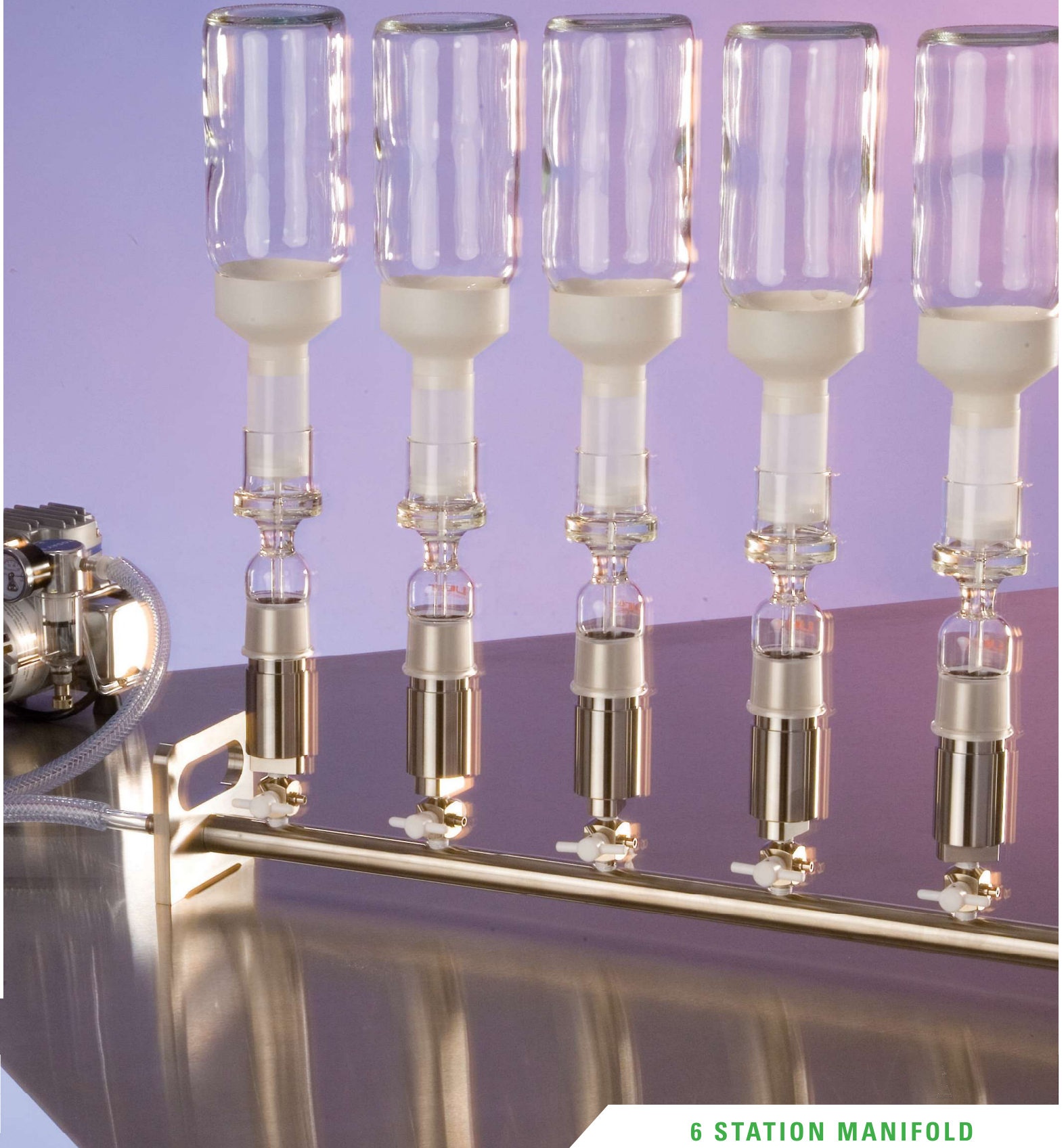
6 STATION MANIFOLD