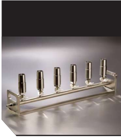
6 Station Manifold