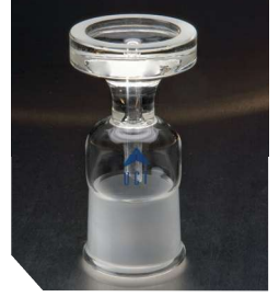
47mm Support Base