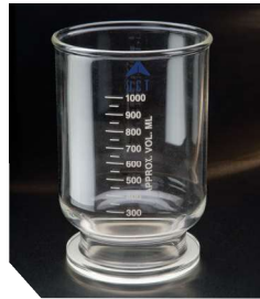
90mm 1000ml Funnel