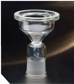
90mm Support Base