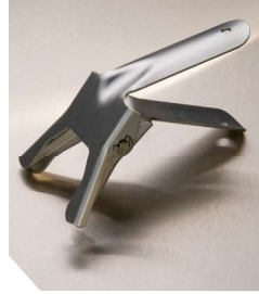
47mm Aluminum Clamp