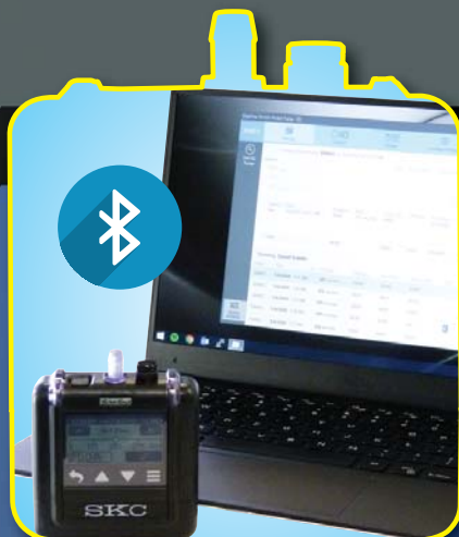
Bluetooth® communication with PC and DataTrac® Pro Software