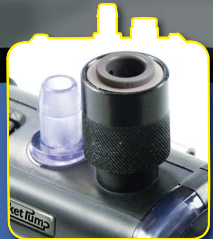
Exhaust port with optional quick-connect accessory for secure bag sampling