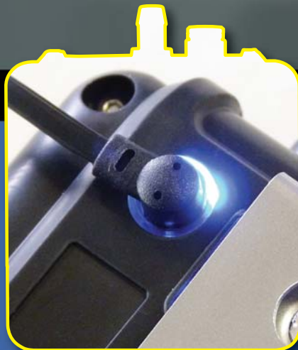
USB charging with magnetic connector and sure-connect LED indicator