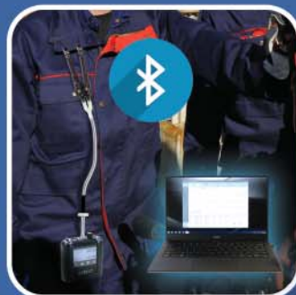
Bluetooth communication with PC for remote pump monitoring