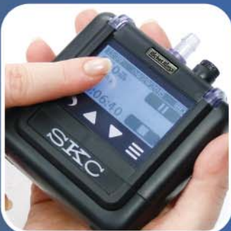
Intuitive TOUCH screen for easy operation and calibration